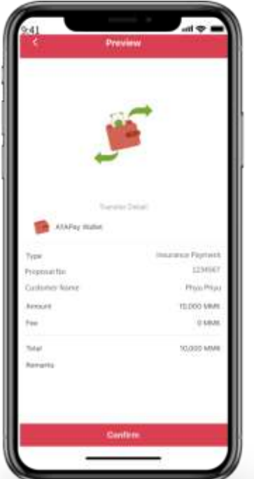
4. Check the info and click confirm.