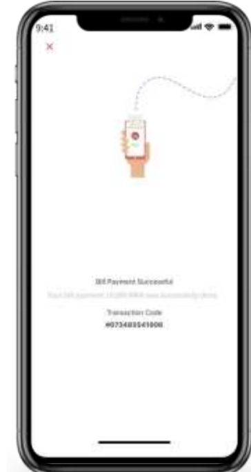
6. Transaction is successfully done.