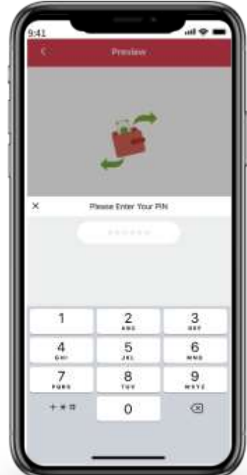
5. Type PIN number.